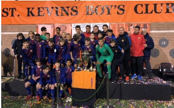
2018 SKB Academy Cup Winners : Barcelona FC

Celtic are one of the very few clubs that hold a special place in the hearts of most Irish people so naturally we have had many requests regarding fixtures and their opponents.